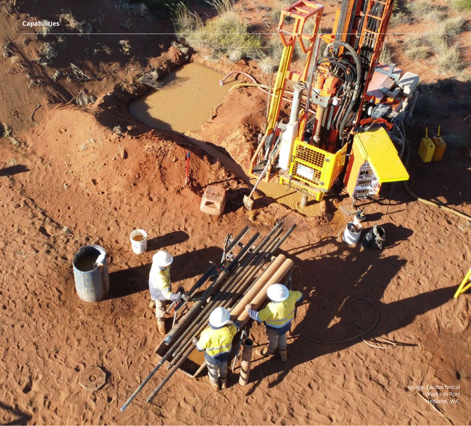
Image: Geotechnical Works in Port Hedland, WA.