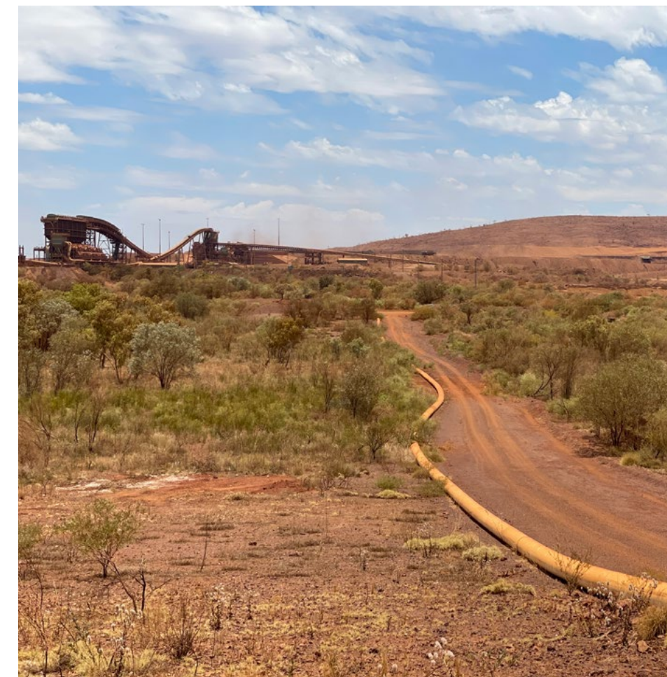
Brockman 4 Mine, Pilbara WA.

Ore from Brockman 4 is loaded onto 300t road trains for transport to Brockman 2 via the B4 Skyways Transfer Pad. Featuring low level floodway crossings, the road has been designed to minimise impact on existing infrastructure and heritage sites.