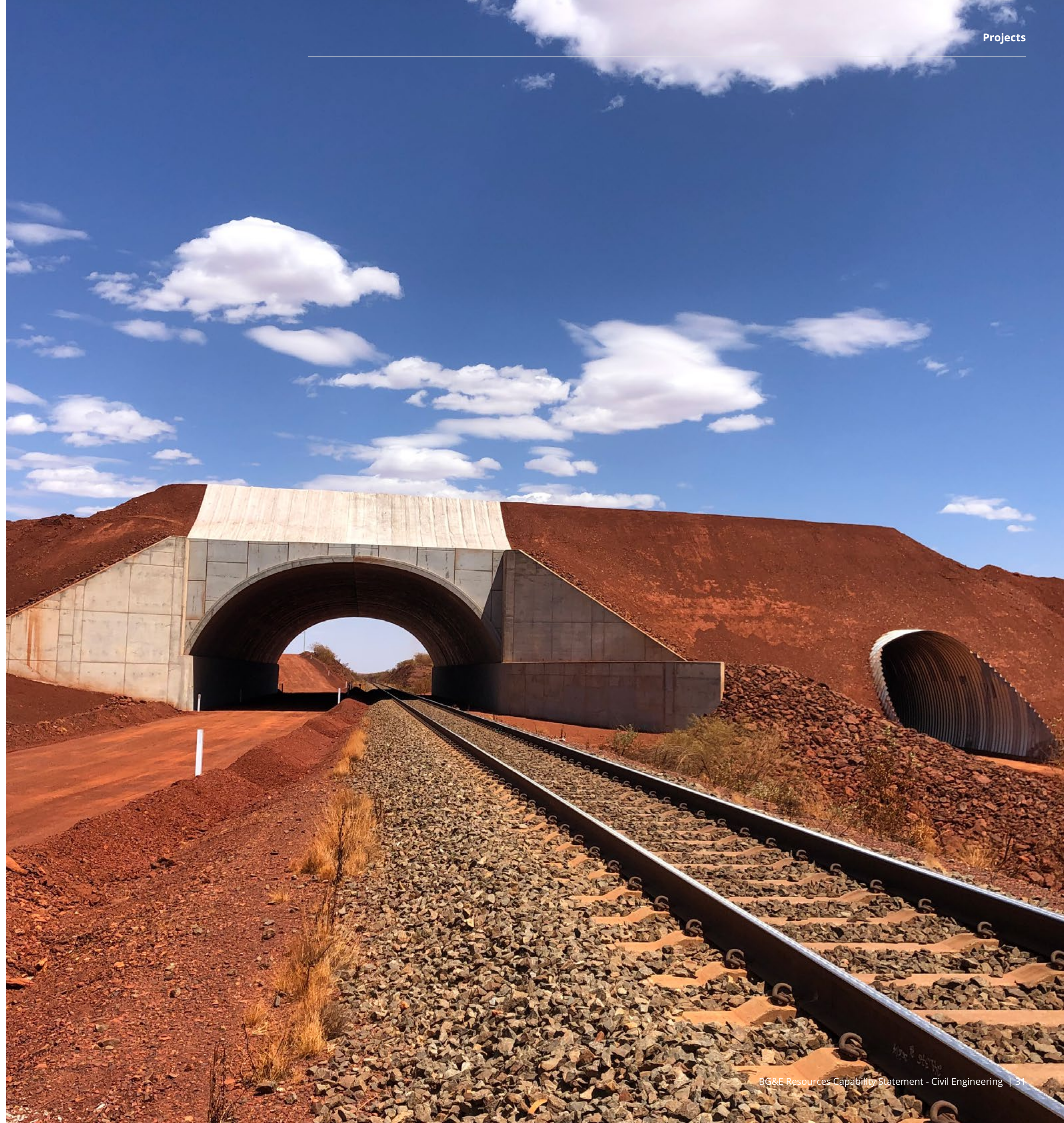
Image: Cloudbreak Iron Ore Mine, Pilbara WA.

The highly collaborative nature of the partnership between Fortescue, Central Systems and BGER was instrumental in the success of this project.