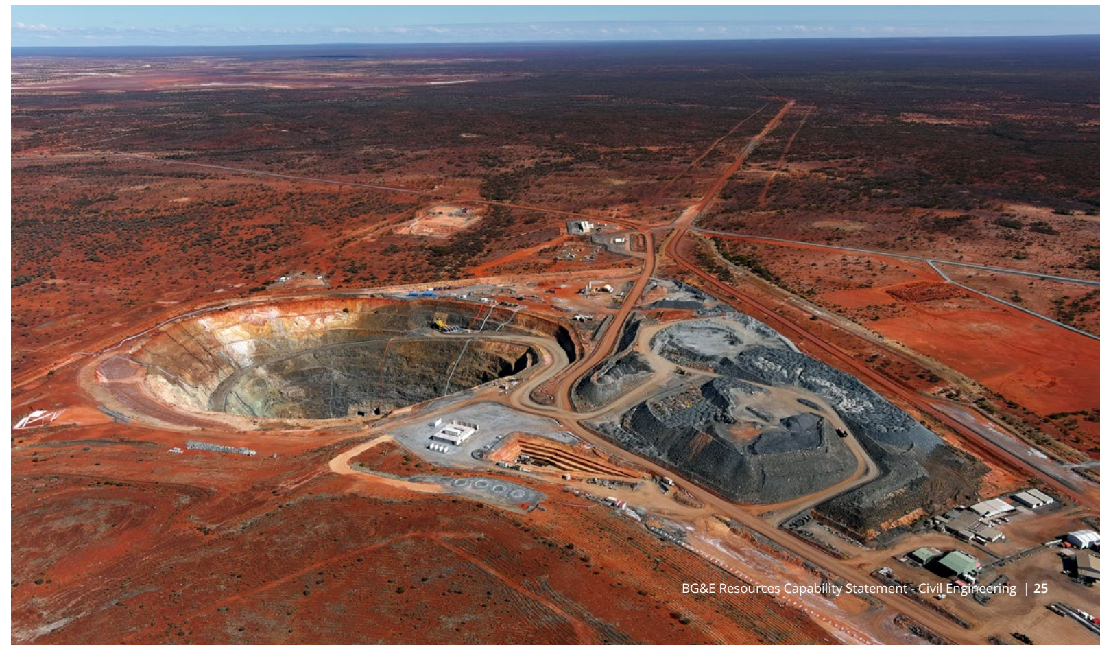
Image: IGO Cosmos Nickel Mine

On the ground, our civil engineering professionals were involved in developing the LV and HV access road design for the NPI area. We also supplied secondment personnel to fulfil superintendent, project engineering and quality management roles.