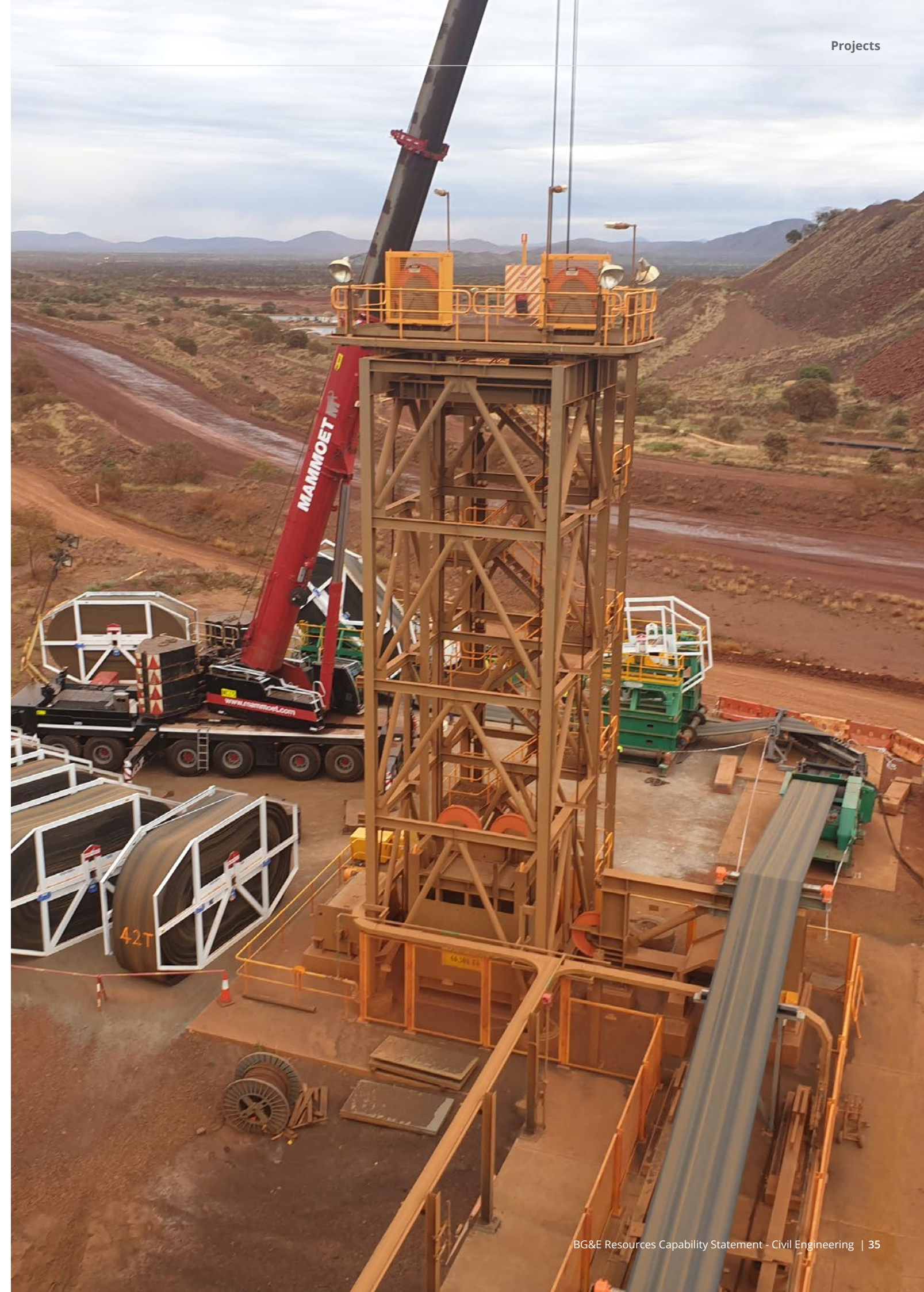
Image: Western Turner Syncline, Tom Price WA.