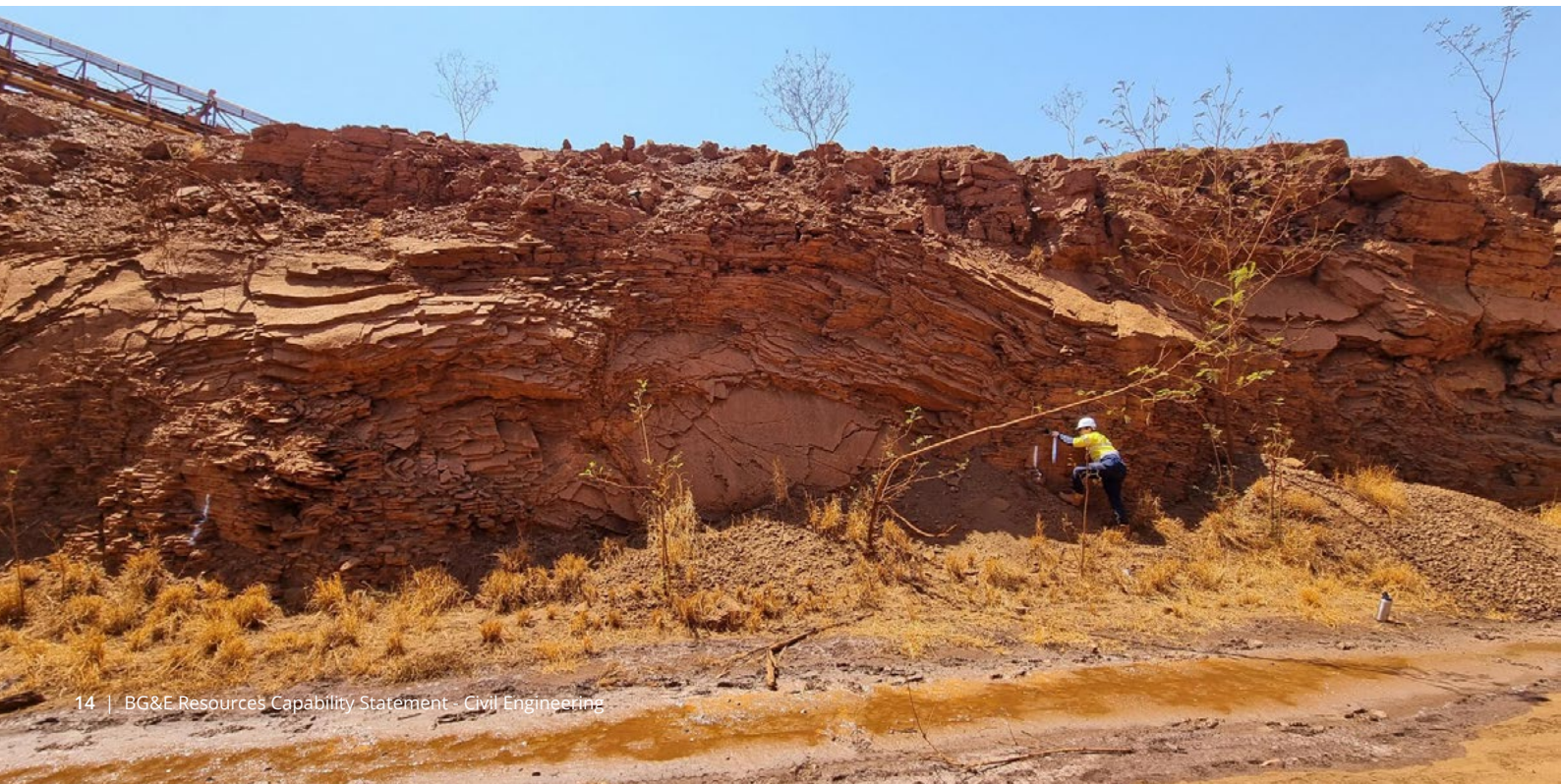
Image: Loui Drake at Lot 1 at Tom Price Mine (Rio Tinto), Pilbara WA.