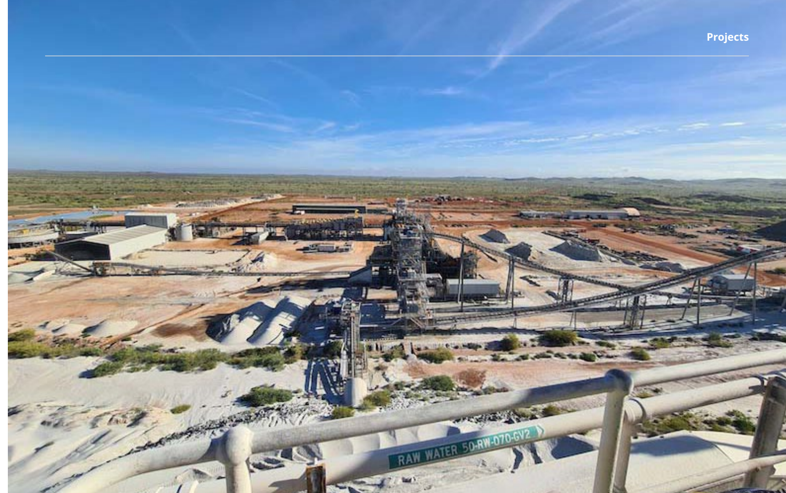
Image: Ngungaju Plant

When complete, the road upgrade will improve the efficiency and safety of transporting critical minerals to Port Hedland to meet the increased demand for resources to enable the global transformation toward clean energy and a sustainable future.