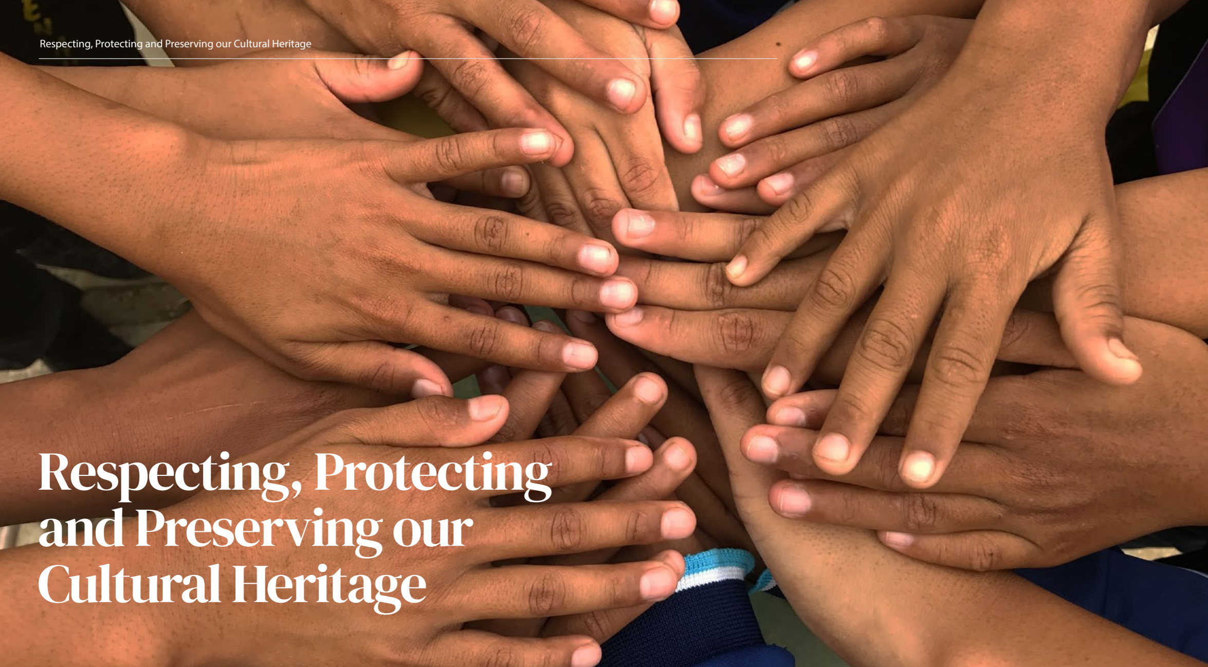
Image: Indigenous peoples' hands.