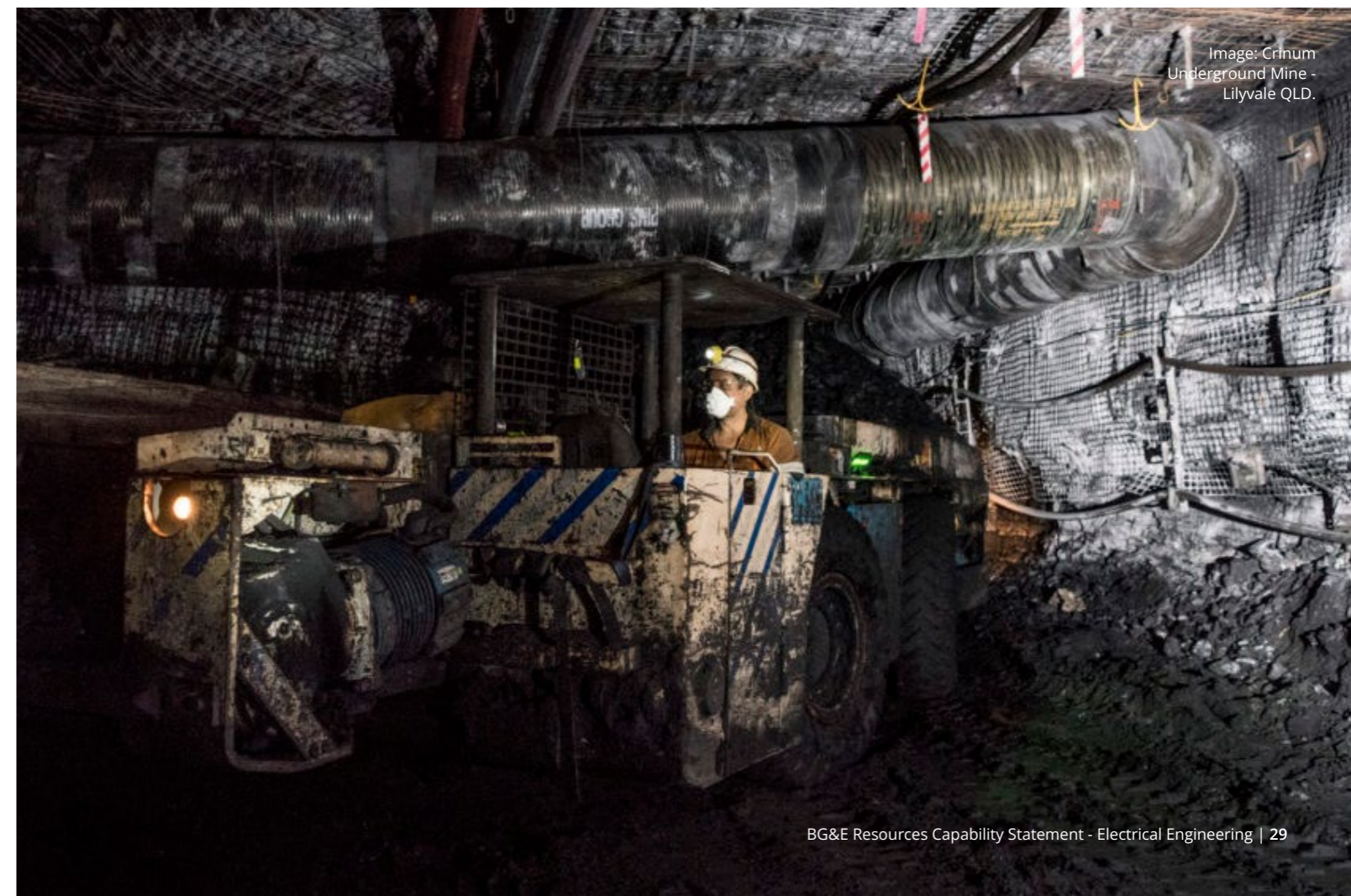
Image: Crinum Underground Mine - Lilyvale QLD.

Our team provided additional capabilities on top of the control systems integration. This included electrical detailed design, working in multi-discipline projects and onsite commissioning management. This experience has given us the ability to understand our client's overall project requirements to assist a successful project outcome.