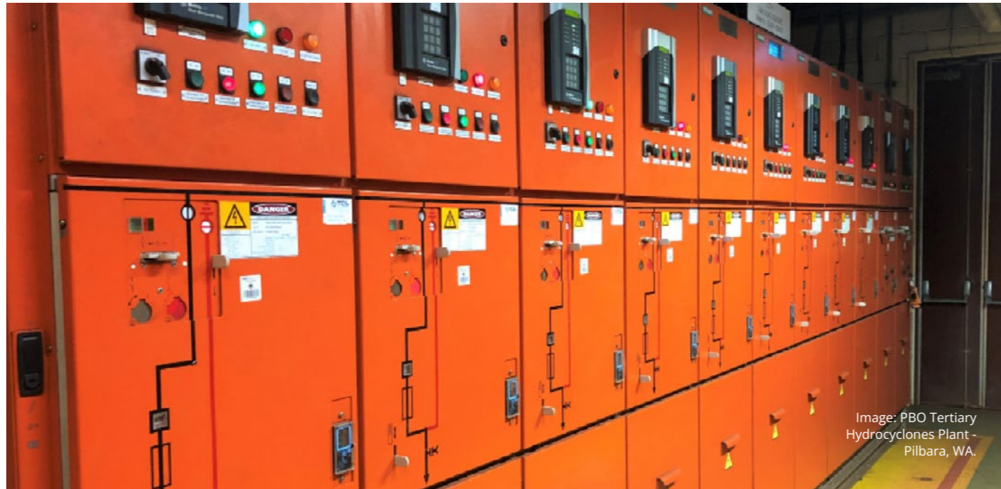
Image: PBO Tertiary Hydrocyclones Plant - Pilbara, WA.