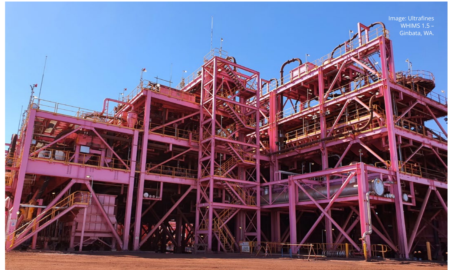
Image: Ultrafines WHIMS 1.5 - Ginbata, WA.

Our electrical team completed the design of 33 kV reticulation to one new substation and the EIC design including existing services relocations, lighting, CCTV, earthing and lightning protection systems.